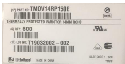
New label with cURus marking

Affected Product Series: TMOV®14, iTMOV®14, TMOV®20, iTMOV®20, TMOV®25S and TMOV®34S Varistor Series. Please see attached the affected part number list.