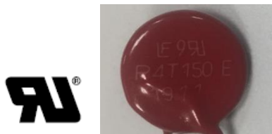
Current UR marking on product surface

This change will take effective from April 22 nd , 2019 and there will be no any changes to the part numbers, and product's electrical and dimensional specifications. Please refer to following current and new product and label marking.