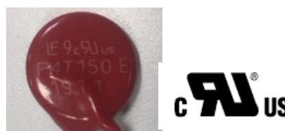
New cURus marking on product surface