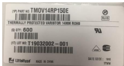
Current label with UR marking