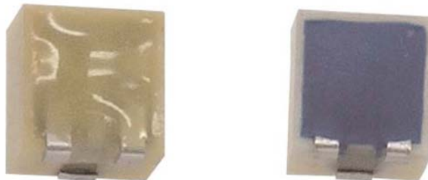
Tan Epoxy Compared to Traditional Blue Epoxy

New samples and test data are available upon request. We will be releasing additional models with the tan epoxy and notice will be made prior to their release.