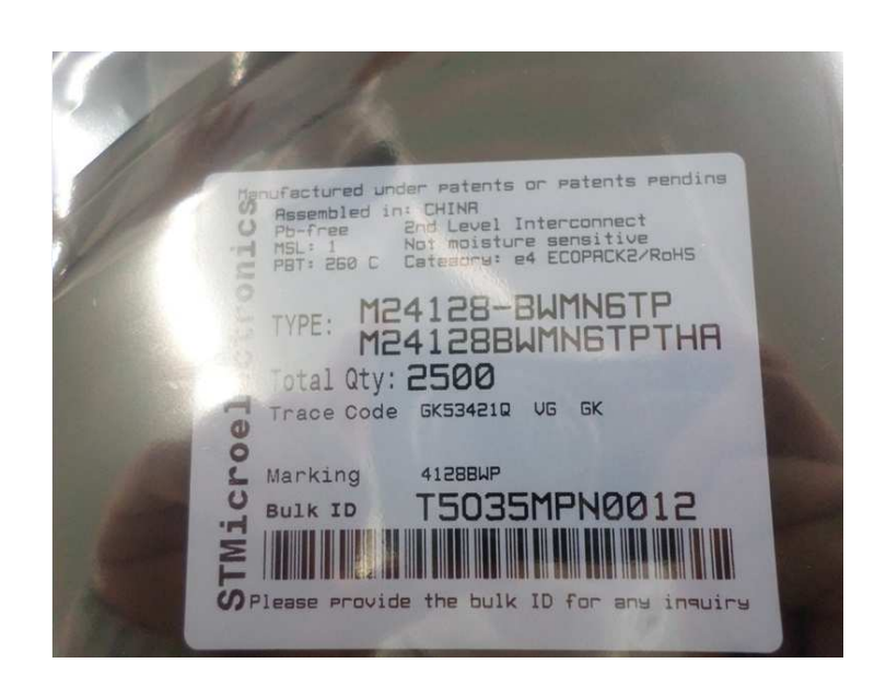
Transparency: fonts on label can be scanned