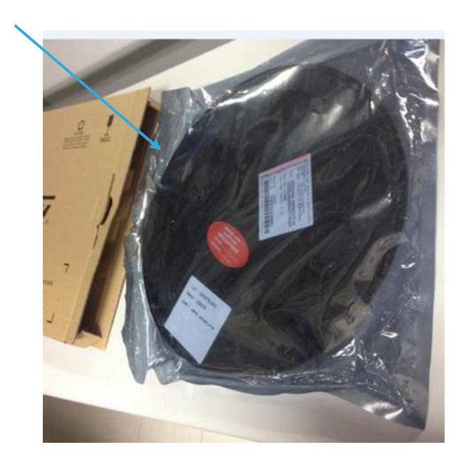
Reel in the bag