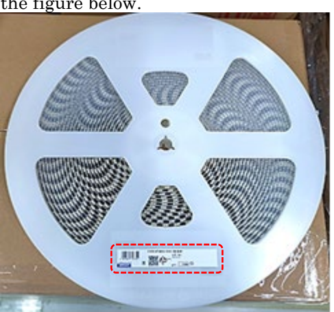
The photo is a typical example.

Reel-attached packing labels Attached to the reel grain processing surface in the figure below.