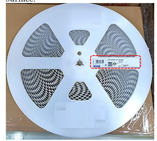
The photo is a typical example.