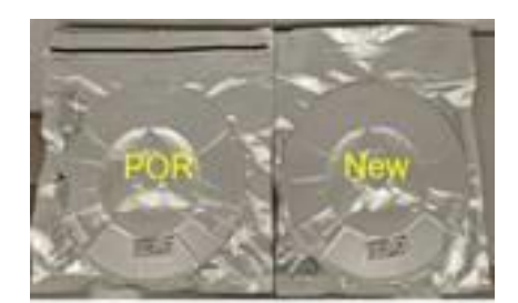
Box with 13" reel size