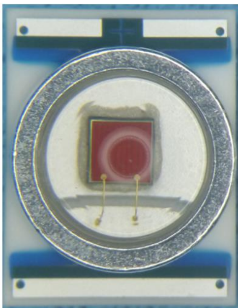
Frontside Current Appearance